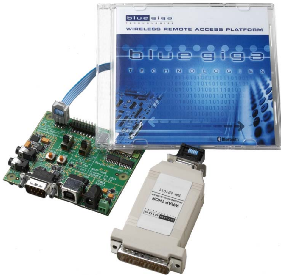
Figure 1: WT11 Evaluation Kit, Onboard Installation Kit and CD